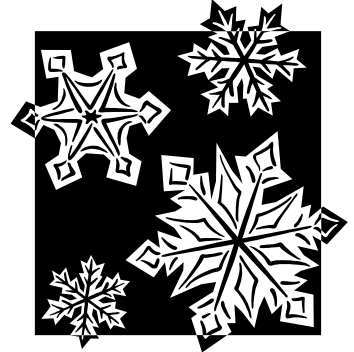
Snow has been a problem for our study center recently